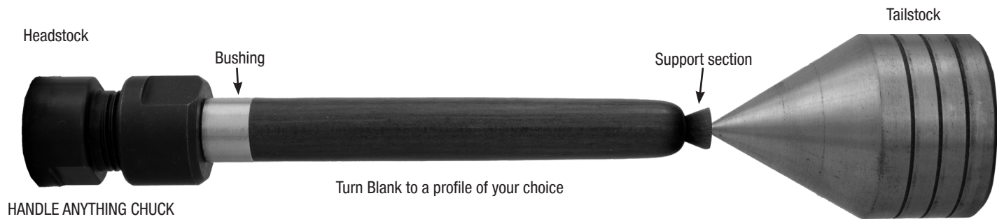
Diagram C / Turning the Blank: